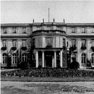
Villa Marlier, about 1916