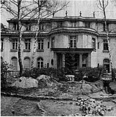
The Villa, 1988