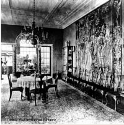
Dinig-room Minoux, 1922