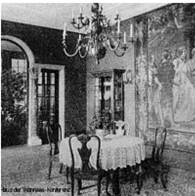
Dining-room Marlier, 1916