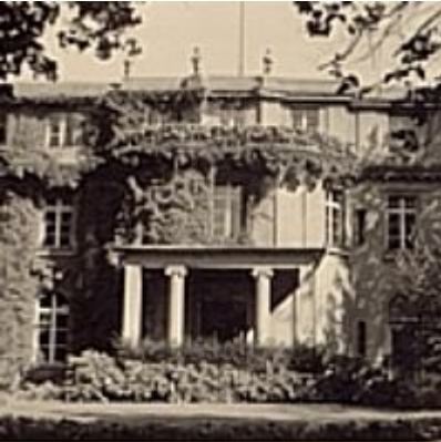
School hostel Neukölln, 1956