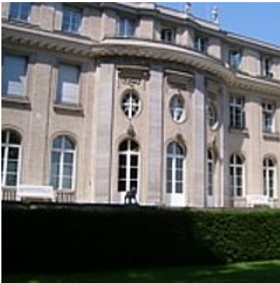
The Villa, 2005