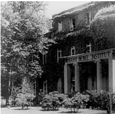
August Bebel Institute, 1947