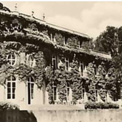
School hostel Neukölln, 1958