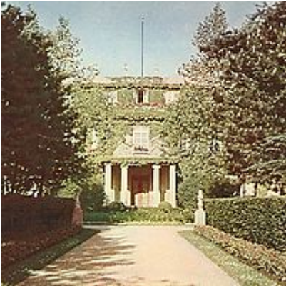
The Villa about 1945