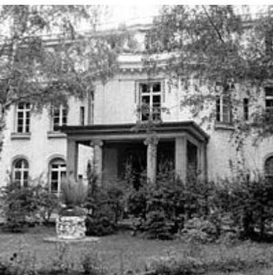
The Villa, 1986